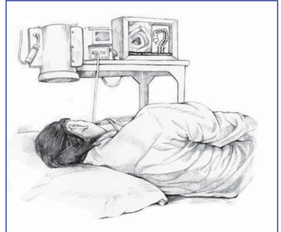
During colonoscopy, patients lie on their left side on an examination table.

During colonoscopy, patients lie on their left side on an examination table. In most cases, a light sedative, and possibly pain medication, helps keep patients relaxed. Deeper sedation may be required in some cases. The doctor and medical staff monitor vital signs and attempt to make patients as comfortable as possible.